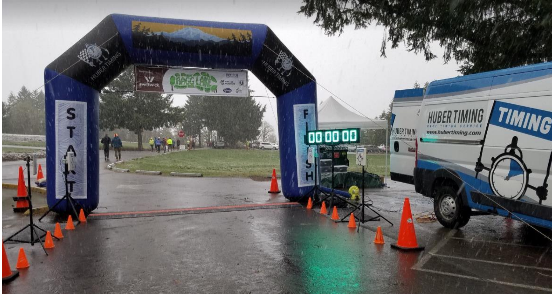
Start and Finish Line for 2018 ORRC Hagg Lake Ultra.