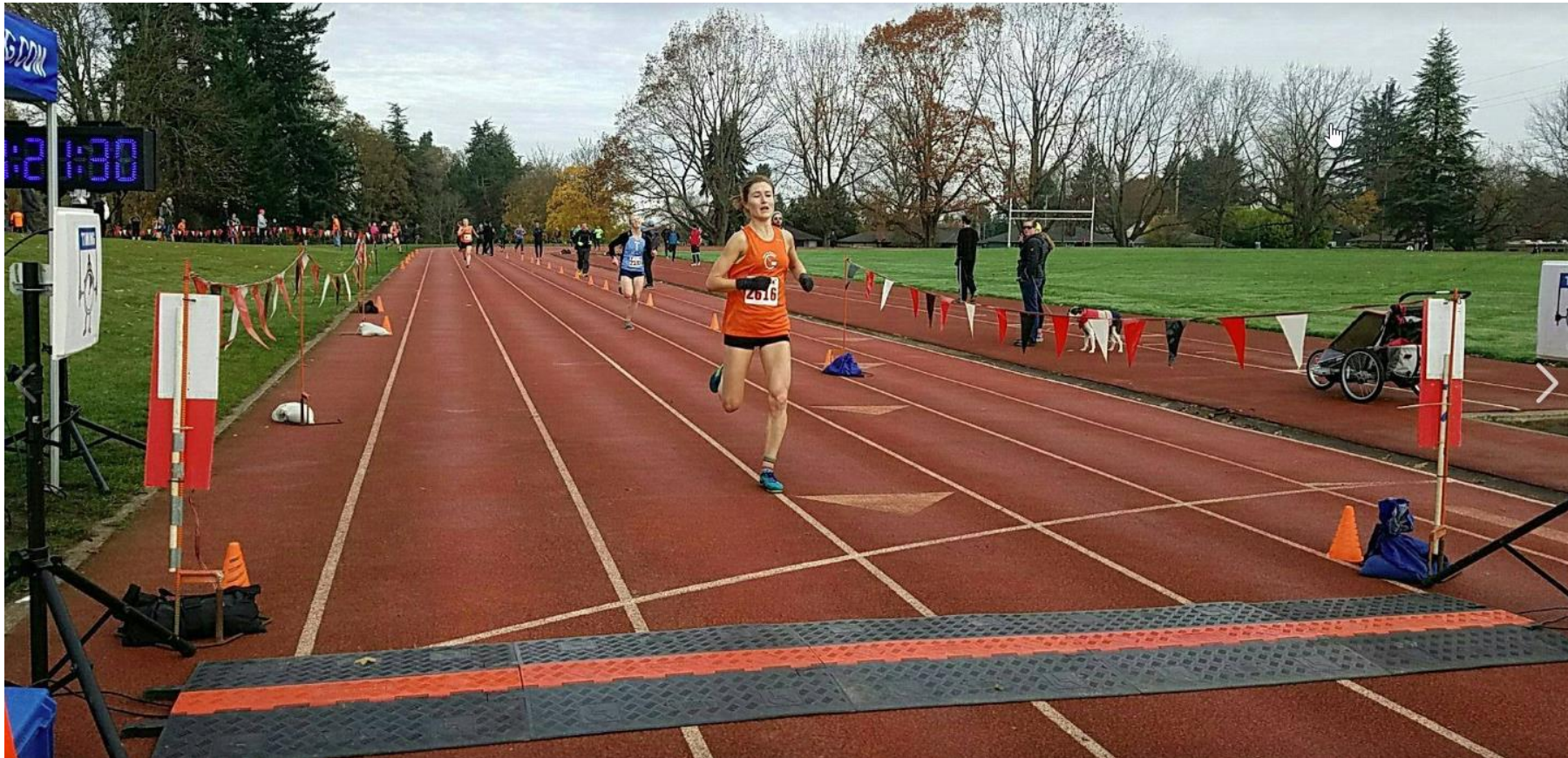
Finish of 2017 Stumptown Fernhill Park XC Race and USATF PNW Regional Championships.