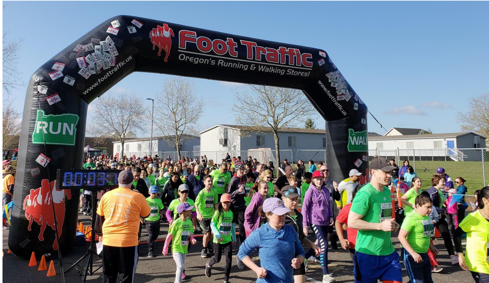
Start of 2018 Stoller 5K. Arch belongs to Foot Traffic.