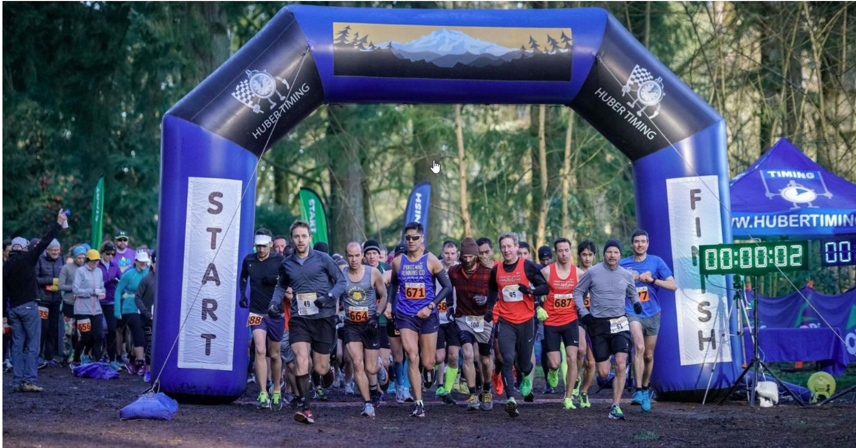
2018 Start of ORRC Champogeg 10K.